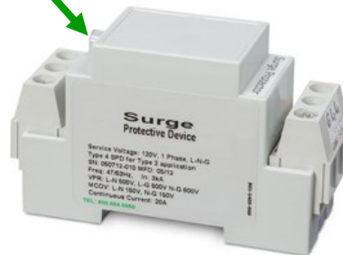
Status Indicating Light

Reduce Lockups Reduce Glitches SAVE MONEY!!